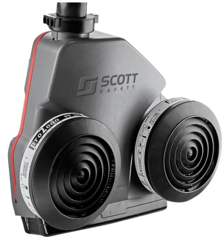
Duraflow Powered Air Respirator