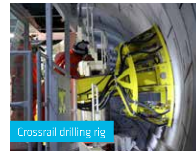
Crossrail drilling rig

This complex process involves 3D laser scanning of the tunnel walls to create a precise plan that is fed into a state-of-the-art drilling rig which moves along the tunnel drilling holes. The team then fixes brackets and walkways to the tunnels to enable the additional systems to be installed.