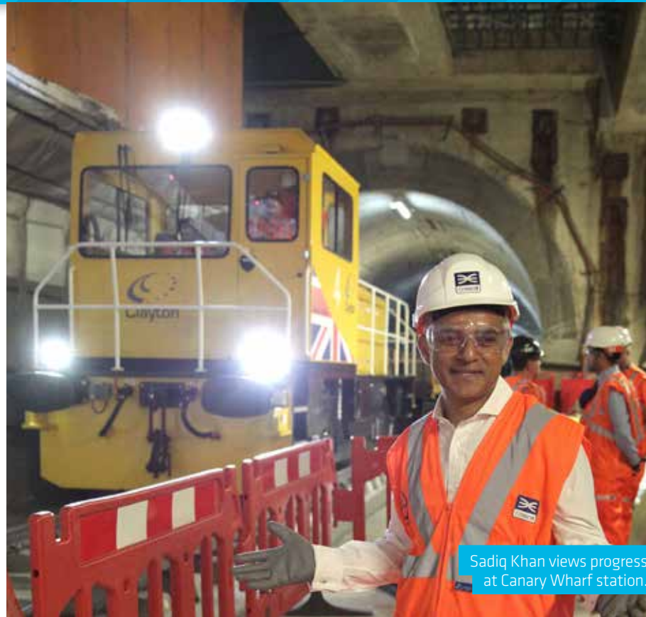
Sadiq Khan views progress at Canary Wharf station.

The remaining 25 per cent of the programme will present a new set of challenges as work continues to finish installing the critical components that will transform the project into an operating railway.